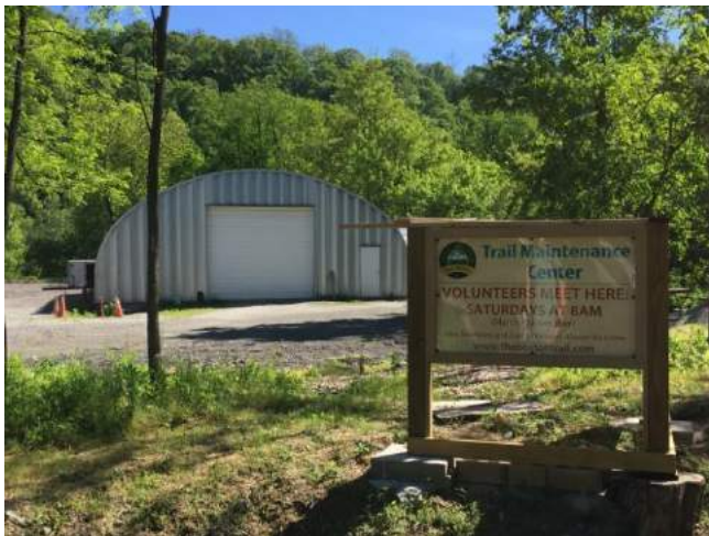
MYTC Maintenance Building

MYTC holds regular work sessions during good weather on Saturday mornings, meeting at 8:00 at the end of Locust Grove Road along the trail in Greenock, off of East Smithfield Street about 2 miles upriver from the Boston Bridge. To be added to MYTC's email distribution list for weekly notices on work sessions, go to the MYTC website – www.thebostontrail.com and click on the "contact us" button to submit your name, email address, phone number, and mailing address.