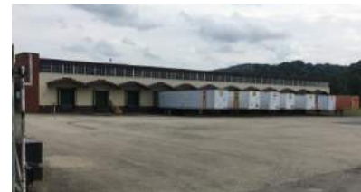
Magic Creations ~2018

stores in 22 states, over 400 employees were at this location.