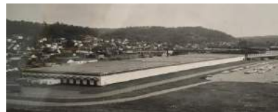
GC Murphy Warehouse ~1963

Company. After several smaller warehouses in the McKeesport area could not handle the distribution load, 15 acres of land was purchased along the B&O Railroad in 1941 and the warehouse opened in December. Due to an expansion of stores, an addition was added in 1963. When GC Murphy was in its prime with over 500