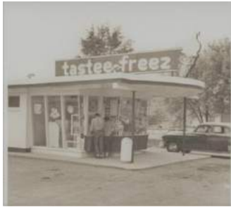
Tastee Freez – Blythedale ~1955