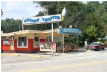
Yough Twister – Blythedale ~2018