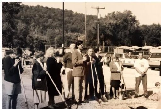
PhotoScan by Google Photos

30 years ago , the Mon/Yough Trail Council was formed to help create and oversee the multipurpose